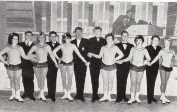
THE BIRMINGHAM FORMATION ICE DANCE TEAM